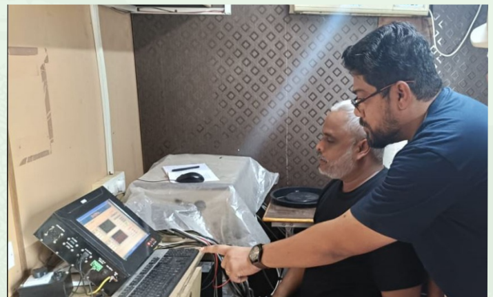
Safety and Function Test of (INOX DF/3000/145 3.0 MW Power Booster Mode 3.3 MW Rotor Blade Type SR71 (T-Bolt), Hub Height 100 m IEC WT Class IIIB” wind turbine with 3.3 MW capacity under Power Booster mode at Rajkot, Gujarat)