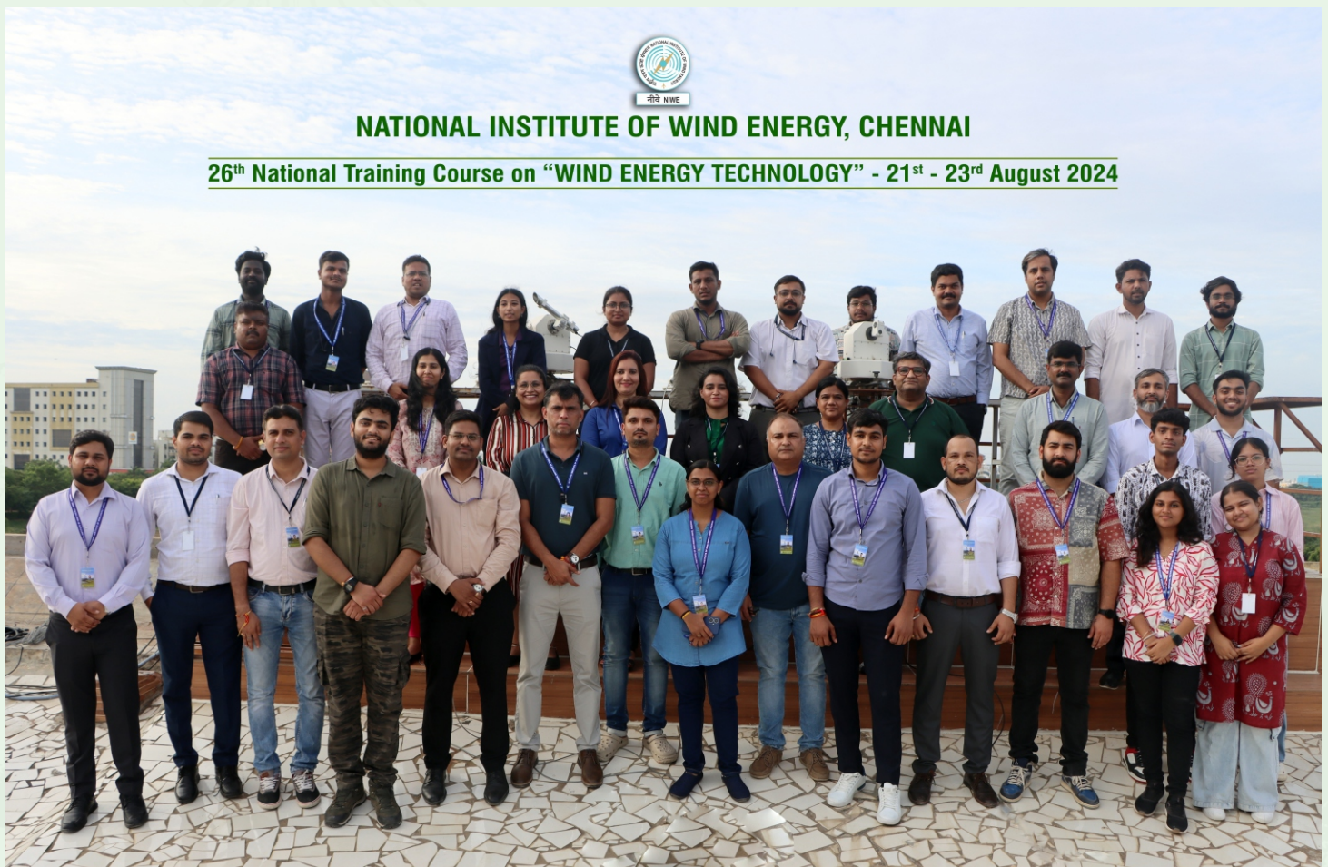
Group Photo with Course Participants