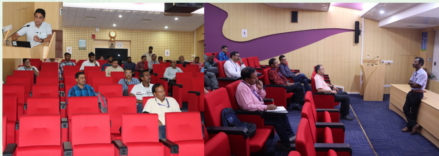
Glimpses of lecture Sessions

During the 3 days course, 11 classroom lectures were scheduled apart from visit to wind turbine training facility. The course content of the training was handled by Scientists and Engineers of NIWE, who have years of experience in the field.