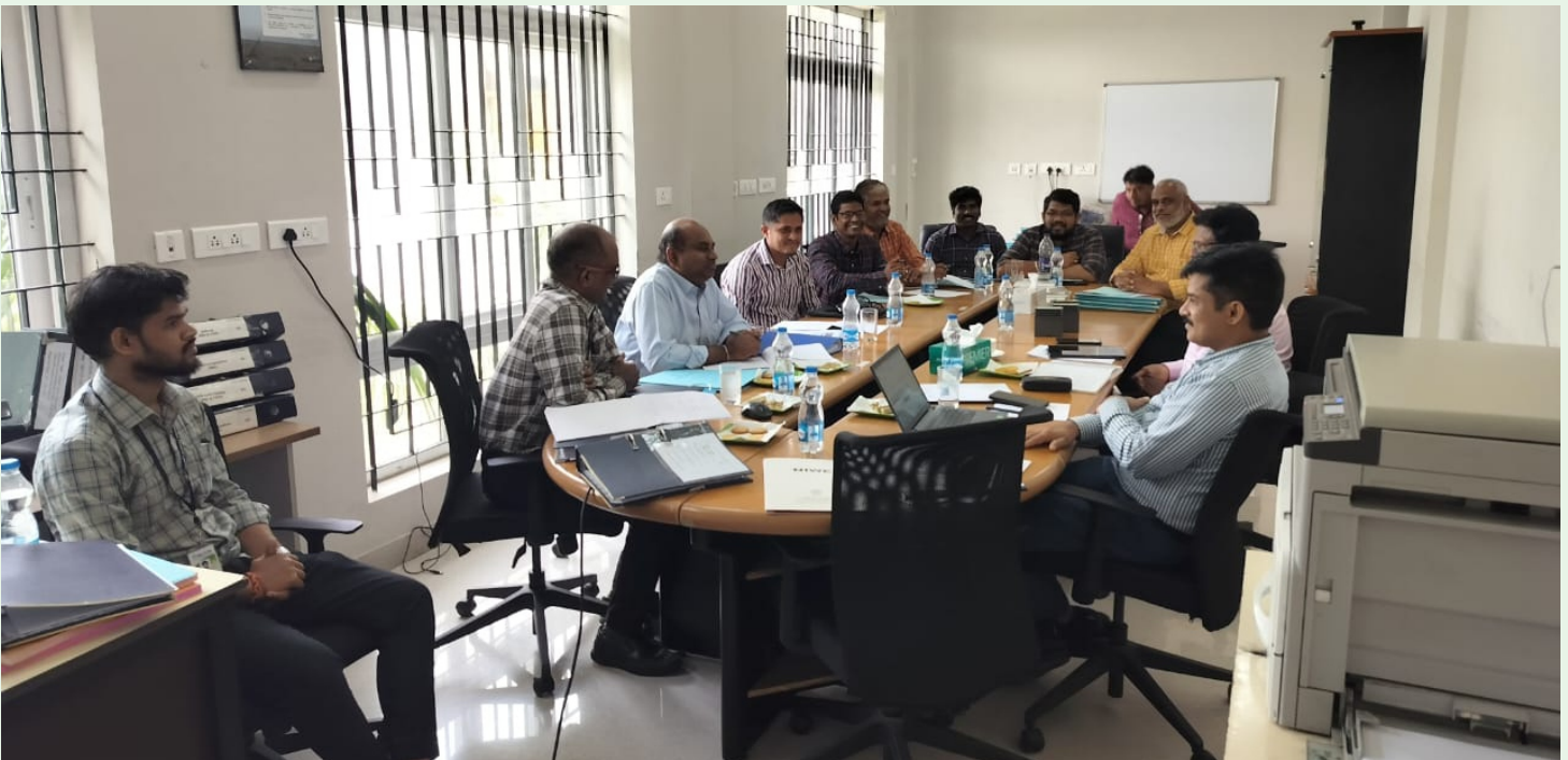
Onsite reassessment audit by NABL (for renewal of accreditation) at WTTS, Kayathar