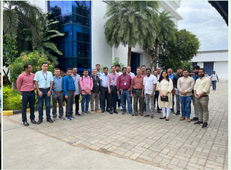
Participants at the Vestas Training Facility

The participants were taken to the training facility of M/s. Vestas Wind Technology India Pvt. Ltd., Ammapettai, Chennai which provided valuable insights into the various components and its finer points in the installation and maintenance of wind turbine. The simulator method which also was supported by having a close look of even the smallest component by means of a Virtual Reality demonstration gave a comprehensive view of the layout and equipment positioning of a wind turbine. The visit to the prototype installation, which had all the components of a wind turbine was equally impressive. The participants also had a bird's eye view of the Blade repair centre of Vestas.