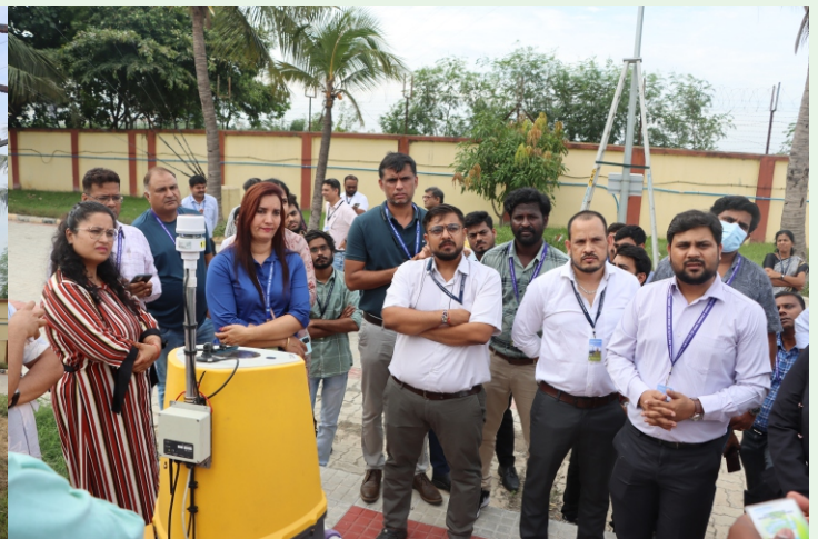
Visit to LiDAR while measuring the Wind parameters