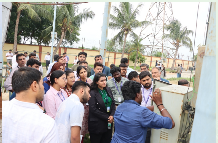
Visit to Solar Calibration Laboratory