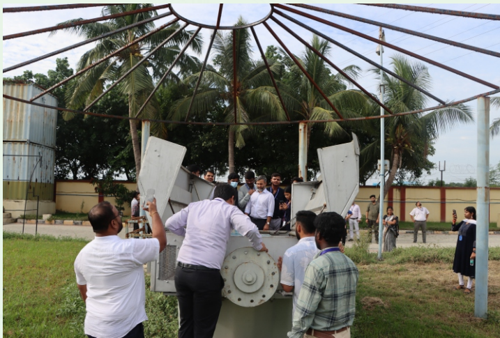
Visit to Wind Turbine Nacelle

The participants visited the Renewable Energy facilities available in NIWE campus for practical exposure, and had an opportunity to understand the Water Pumping Wind Mill, Vertical and Horizontal Axis Small Wind Turbines, Wind-Solar Hybrid System, Wind Turbine Nacelle, Wind Monitoring Station - Meteorological Mast, LiDAR, Solar Calibration Laboratory and Solar Radiation Resource Assessment (SRRA) Station.