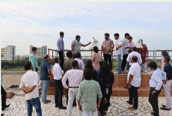
Data Logger in the Met Mast being explained