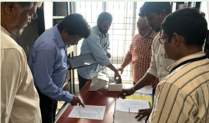
Onsite reassessment audit by NABL (for renewal of accreditation) at WTTS, Kayathar